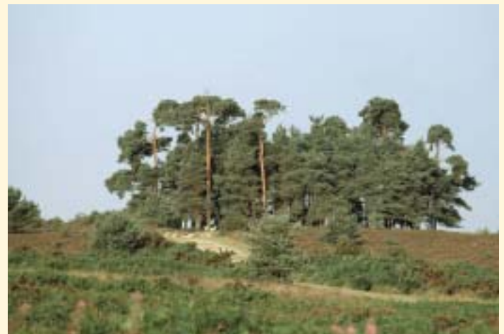
Ashdown Forest clump

As soon as you like. There are no deadlines.